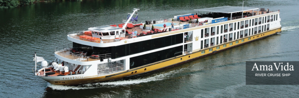
AmaVida RIVER CRUISE SHIP

Timeless elegance spills from the decks of the AmaVida, a ship that debuted on Portugal and Spain's Douro River in 2013. Rust and gold color schemes bring together the Douro's breathtaking sunsets and a sepia hue that conjures timeworn snapshots of the world's oldest demarcated wine region. Most staterooms feature balconies from which to enjoy views of terraced vineyards, as well as Entertainment-On-Demand, climate-controlled air conditioning and an in-room safe. AmaVida's passionate chefs will treat you to exquisite, locally-sourced cuisine paired with unlimited local wine—and the region's signature Port—as well as beer and soft drinks with lunch and dinner in the Main Restaurant cada noche.