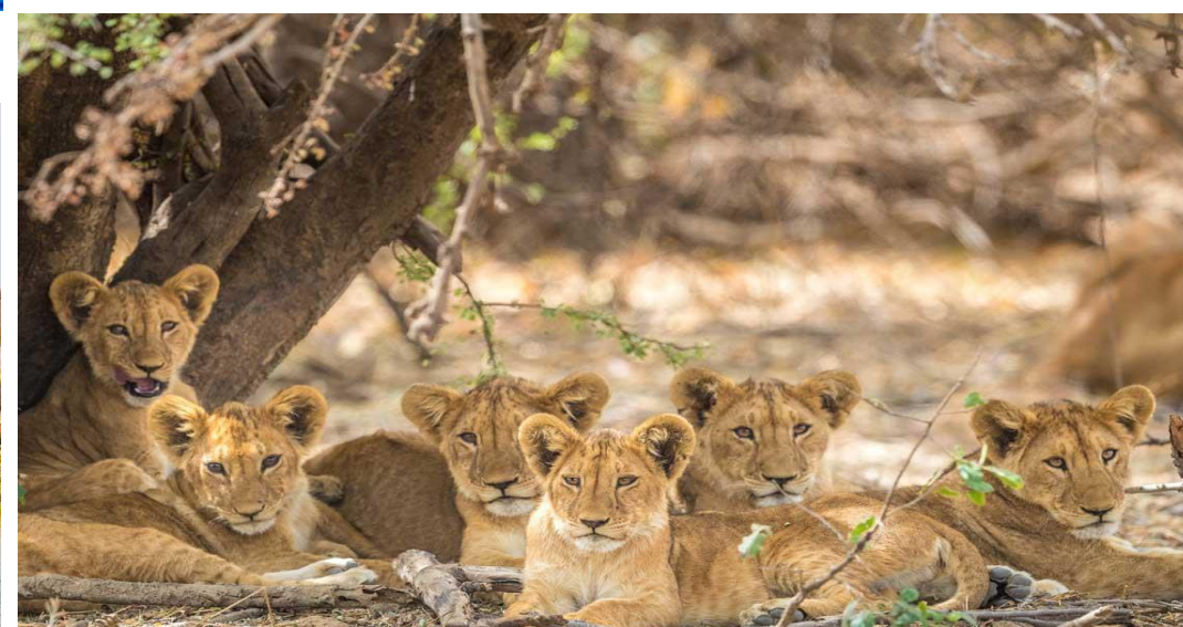
Reference source [8]