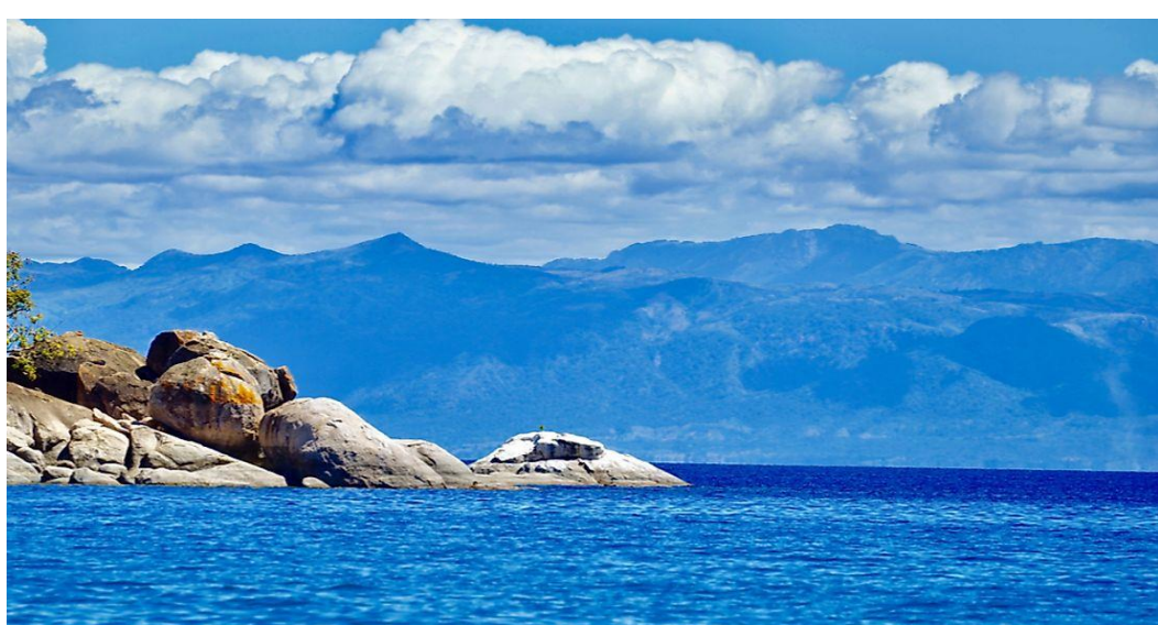
Reference source [3]