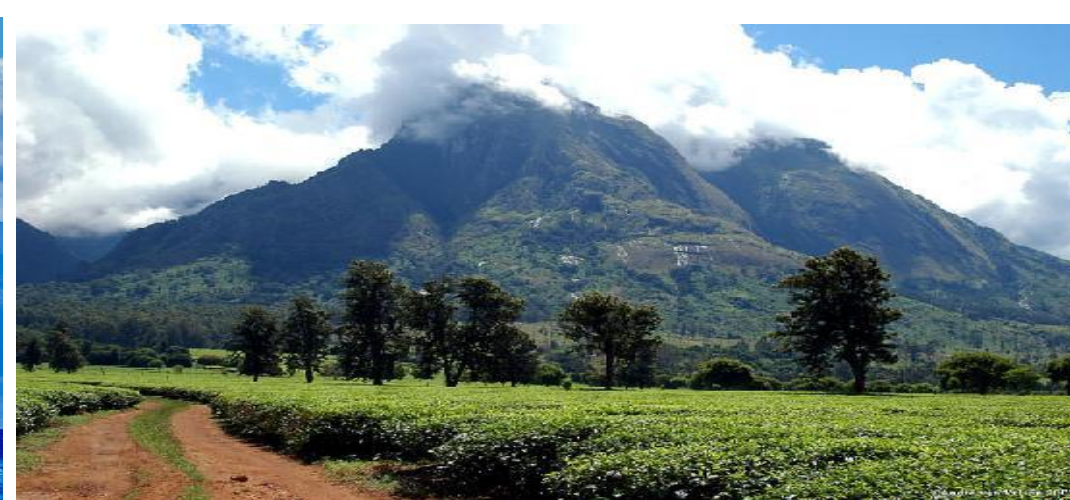
Reference source [2]