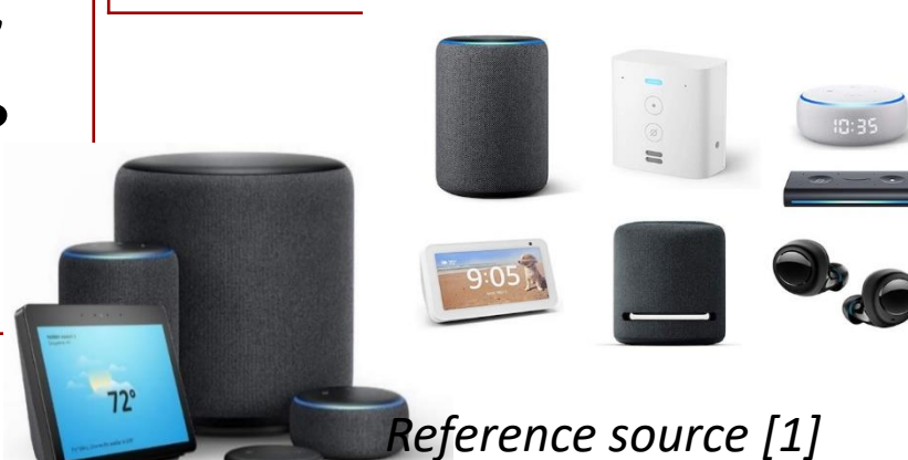
Reference source [1]