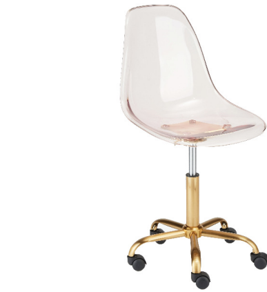
TRANSLUCENT PLASTIC SWIVEL CHAIR