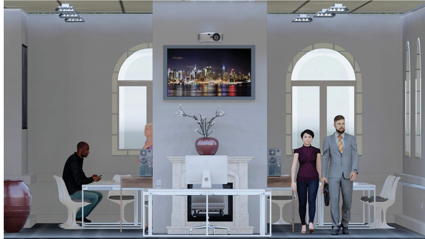
CONFERENCE ROOM ELEVATION