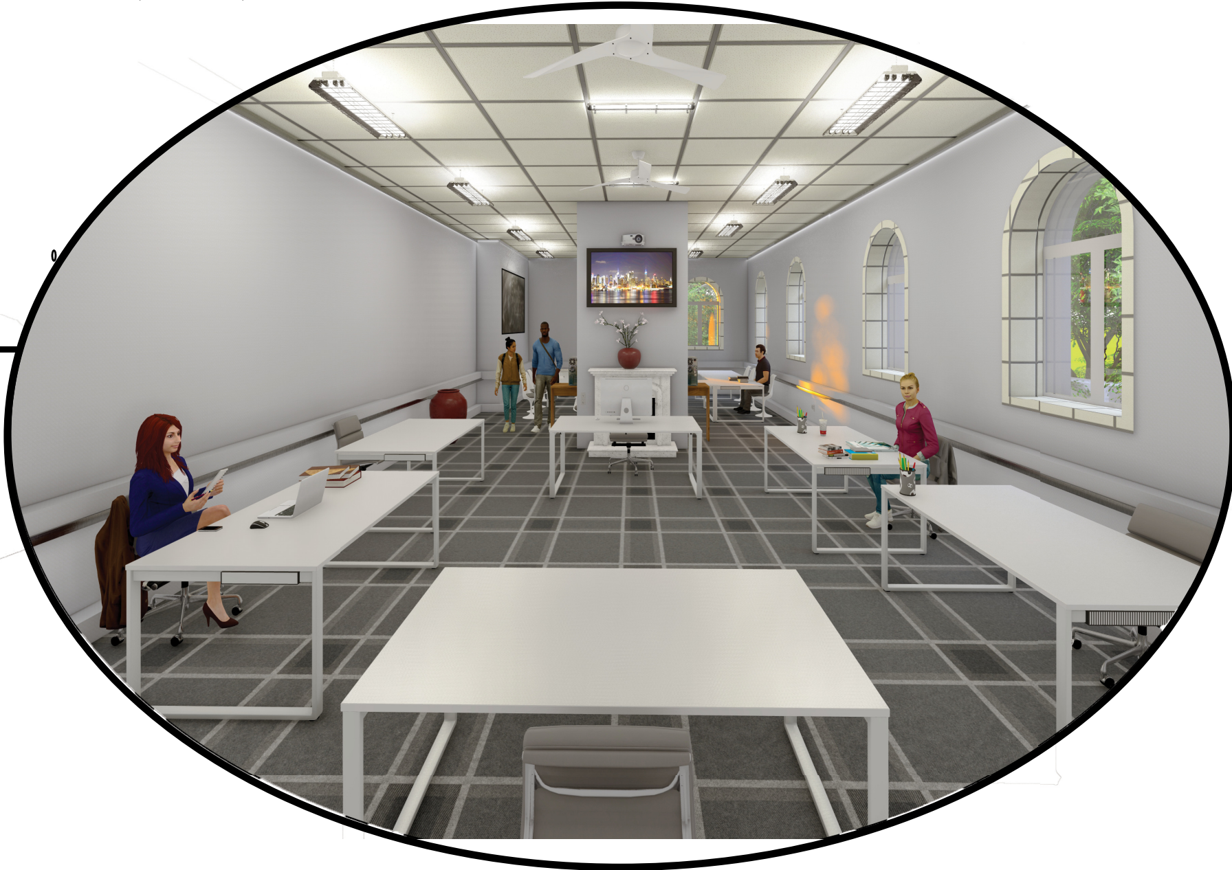
MULTIPURPOSE ROOM : STUDY AREA SET-UP

SMART TECHNOLOGY Smart devices create for access to digitally available information and a more convinient approach to services. Featured services include Book vending machines for faster rental drop-offs.