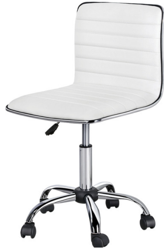
ADJUSTABLE DESK CHAIR