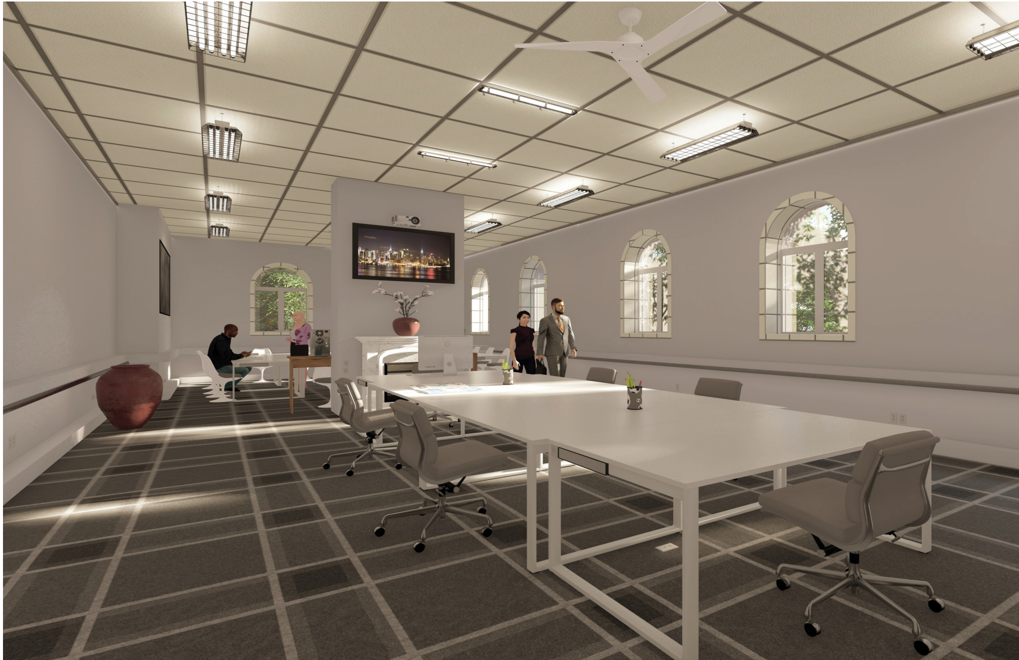
MULTIPURPOSE ROOM : CONFERENCE ROOM SET-UP