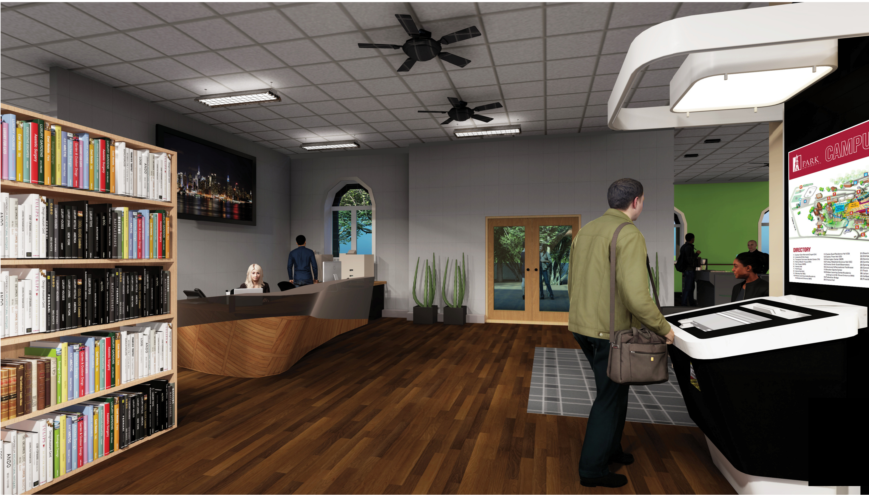
LIBRARY ENTRANCE LOBBY

This Adaptive Reuse form of Historical Preservation by the Park Alumni Association aims to create a functional and modern library for Park University & the Parkville community. The Park Pirate Library will serve to provide the Parkville community with open access to technology, information, foster and promote the academic culture which is the building foundation of the Park Alumni Association. The design will incorporate natural light and smart technology making it sustainable and energy efficient.