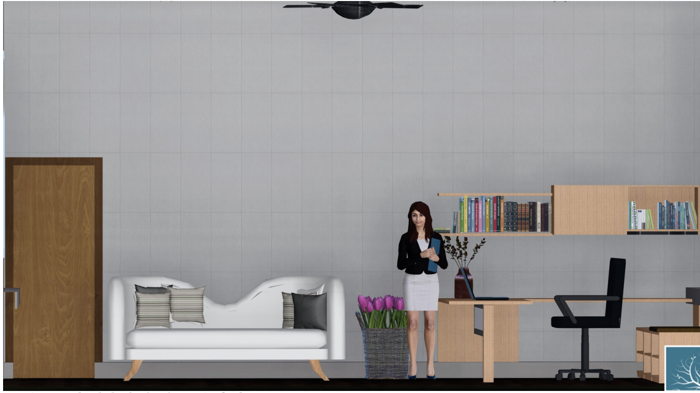
MAIN OFFICE ELVATION