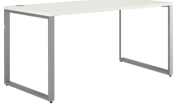
LIGHT MOBILE WORK SURFACE